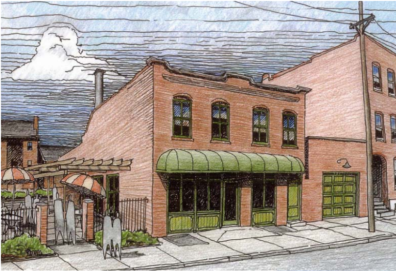
9TH STREET ELEVATION

±1,400 - 10,400 SQ. FT. RETAIL FOR LEASE - SOULARD